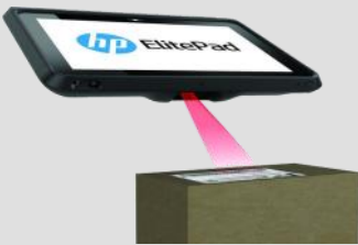
HP Retail Jacket

Call for information on any of these new POS devices.