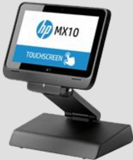
HP Retail Dock